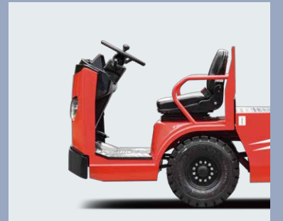
Full suspension operating platform, vibration is reduced, noise is isolated