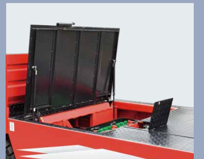
Repair, maintenance and replacement of the battery are convenient and fast, and it is suitable to continuous work