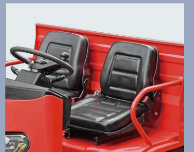
2 operators on board, optimised driving position for maximum comfort and efficiency