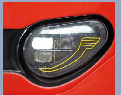
LED headlight has the head light and dipped light functions. The front turn light utilizes the latest stream light technology