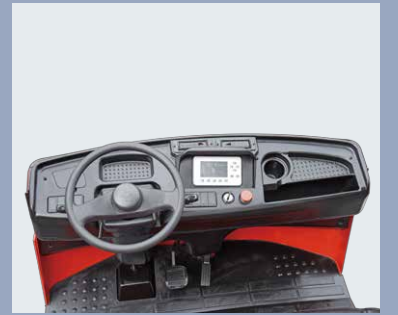
Large screen display, the instrument panel adopts injection molding design, sturdy and durable